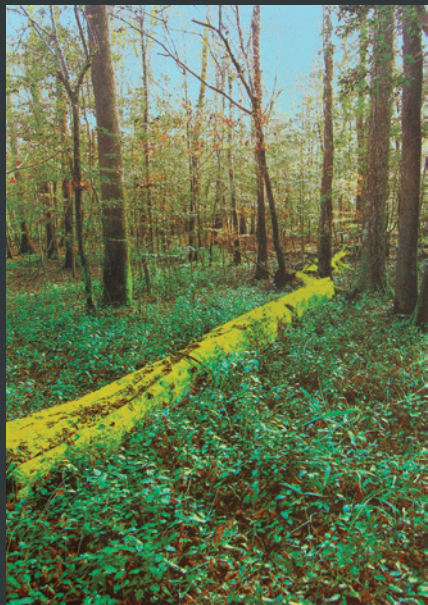
Treelee MacAnn Congaree Forest Ribbon Serigraph on paper Myrtle Beach, SC