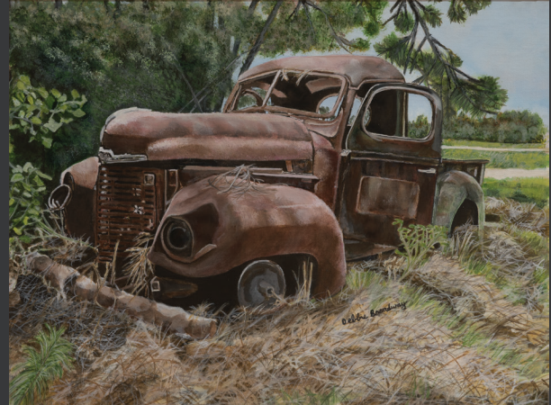
Yvette Cummings Horry County When the Magpie Came Acrylic on canvas